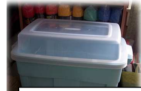
Tote & Plunger Laundry System